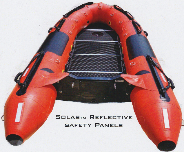
SOLAS™ REFLECTIVE SAFETY PANELS